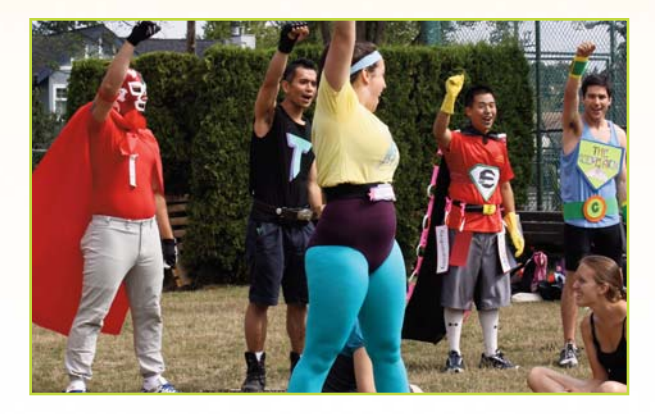
Play it Fair! Heroes in Vancouver (Thanks to Britannia Community Centre)

"Accept you, accept me, embrace di-vers-it-y!"