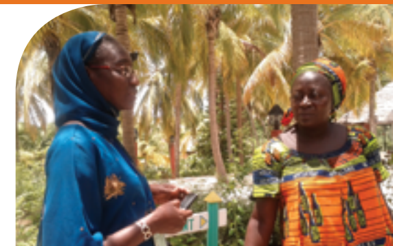
Above: Senegalese partners in discussion at the two-week Human Rights Training Session, September 2012, Saly-Portudal, Senegal.

This collaboration proved successful: the perpetrator was finally sentenced to prison. Being one of the first cases of the kind to be prosecuted, the ruling set an important precedent in Senegalese jurisprudence. Leveraging