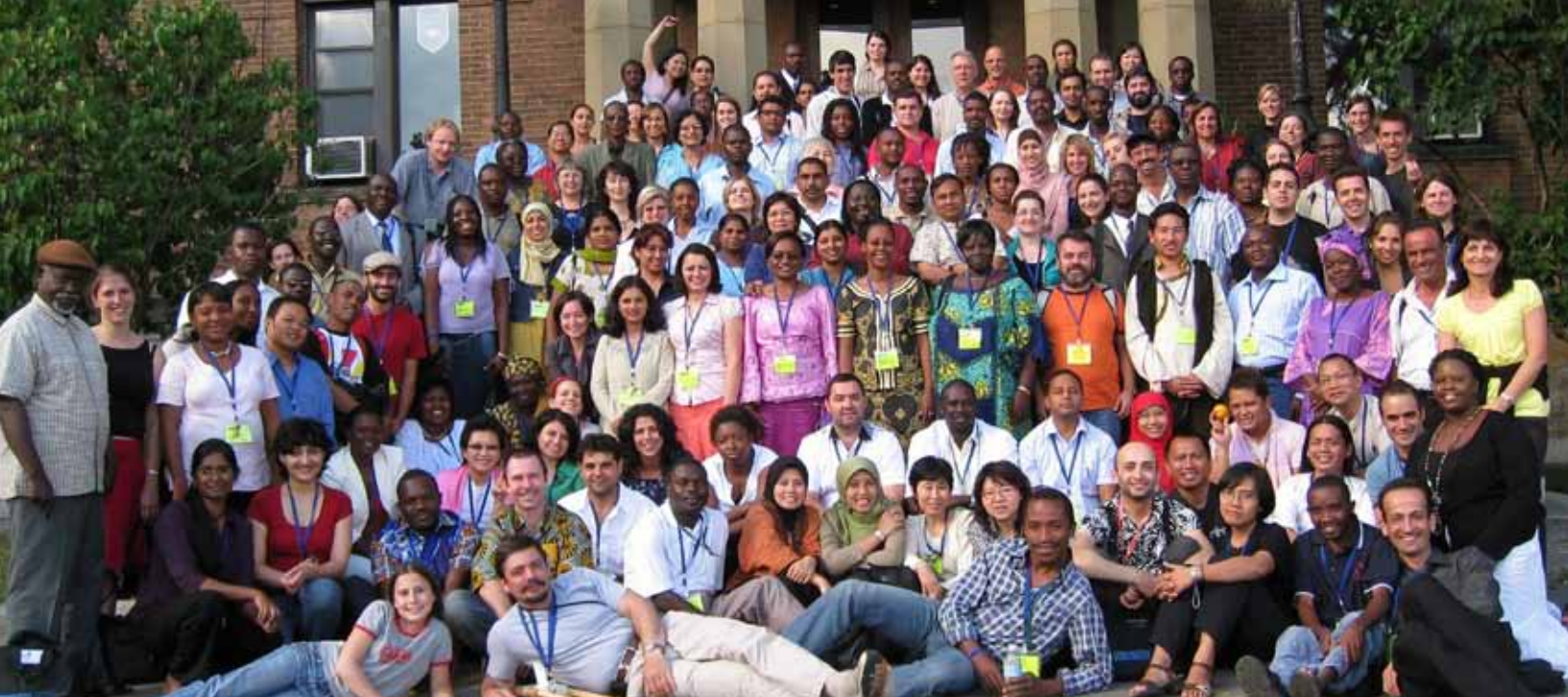
PARTICIPANTS AT THE 29TH ANNUAL INTERNATIONAL HUMAN RIGHTS TRAINING PROGRAM, JUNE 8 - JUNE 27, 2008, STE-ANNE-DE-BELLEVUE, QUEBEC