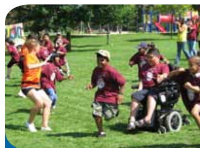
OVER 200 CHILDREN ATTENDED PLAY IT FAIR! DAY, A CELEBRATION OF HUMAN RIGHTS AND RESPECT FOR DIVERSITY, HOSTED BY TORONTO PARKS, FORESTRY AND RECREATION ON AUGUST 14, 2008.