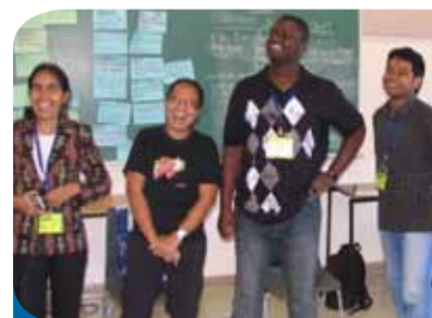
CLASSROOM WORK AT THE IHRT