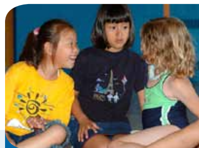
THE GAMES IN THE PLAY IT FAIR! TOOLKIT PROMOTE DIVERSITY AND HARMONIOUS INTERCULTURAL RELATIONS