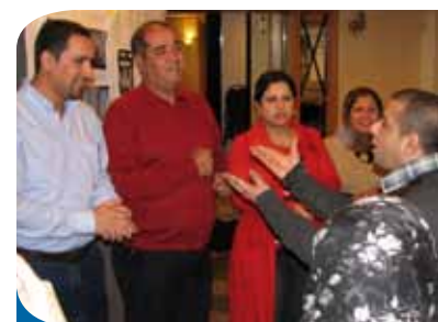
EVALUATION SESSION, MIDDLE EAST PROGRAM, BEIRUT, LEBANON, FEBRUARY, 2009

Clubs composed of students and teachers are working to promote human rights and citizenship values in 20 schools in Marrakech.