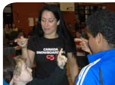
AT THE LAUNCH OF THE PLAY IT FAIR! PROGRAM IN VANCOUVER, CITY OFFICIALS AND OLYMPIC SNOWBOARDER ALEXA LOO JOINED CHILDREN AND STAFF FROM LOCAL COMMUNITY CENTRES TO EXPERIENCE GAMES FROM THE TOOLKIT.