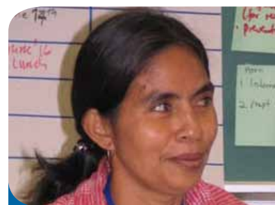
DAY 4 AT THE IH RTP: WHAT IS A CULTURE OF HUMAN RIGHTS?

In 2008-2009, alumni groups in Haiti, East Africa, West Africa and the Philippines also began working with Equitas to develop similar initiatives based on adapting the IH RTP to their own context.