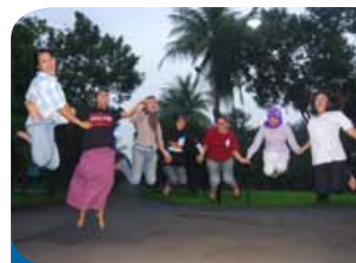
2 ND ANNUAL HUMAN RIGHTS TRAINING PROGRAM, INDONESIA, FEBRUARY 2009

Early in 2009, Equitas joined the Canadian Council for International Co-operation, a coalition of Canadian voluntary sector organizations working globally to achieve sustainable human development. Meanwhile, we continued our engagement in the Association québécoise des organismes de coopération internationale (AQOCI) .