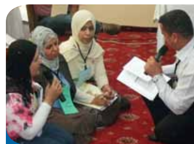
TRAINING SESSION FOR IRAQI NGOS, ISTANBUL, TURKEY, MAY 2008