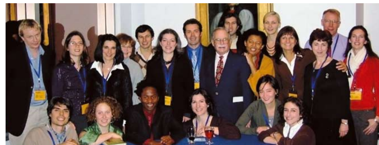
ISHMAEL BEAH WITH EQUITAS STAFF AND VOLUNTEERS