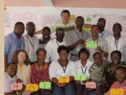
TRAINING OF TRAINERS, MONTROUIS, HAITI