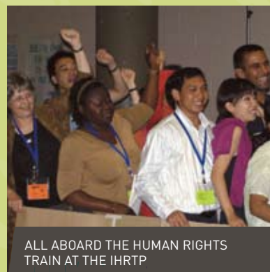
ALL ABOARD THE HUMAN RIGHTS TRAIN AT THE IHRTTP

Equitas is working to increase the capacity of organizations to more effectively monitor State compliance with national and international standards for the protection and promotion of women's rights and gender equality.