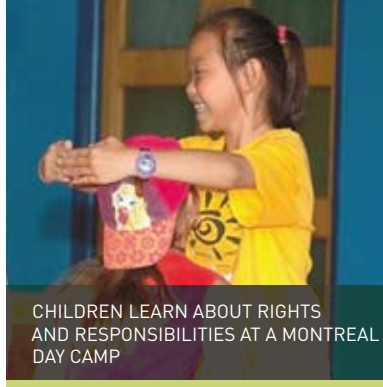
CHILDREN LEARN ABOUT RIGHTS AND RESPONSIBILITIES AT A MONTREAL DAY CAMP

I HAVE ATTENDED A NUMBER OF INTERNATIONAL CONFERENCES BUT WHAT I SAW AT THE IH RTP WAS UNBELIEVABLE. PLEASE KEEP UP THE GOOD WORK. I AND MY TEAM ARE WORKING HARD TO PUT INTO USE ALL THE KNOWLEDGE AND SKILLS WE ACQUIRED AT THE TRAINING.