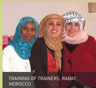
TRAINING OF TRAINERS, RABAT, MOROCCO

I ACQUIRED KNOWLEDGE THAT ALLOWED ME TO HOLD TRAINING SESSIONS WITH WOMEN IN PREPARATION OF OUR ELECTIONS.