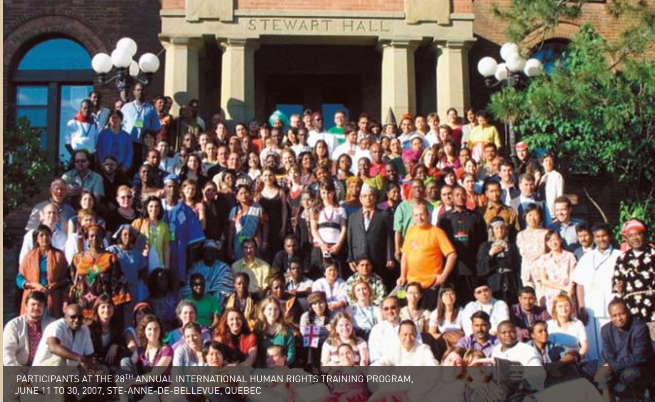
PARTICIPANTS AT THE 28 TH ANNUAL INTERNATIONAL HUMAN RIGHTS TRAINING PROGRAM, JUNE 11 TO 30, 2007, STE-ANNE-DE-BELLEVUE, QUEBEC