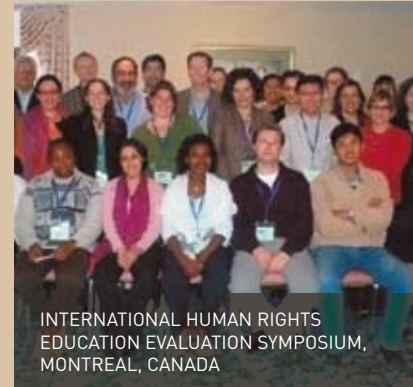
INTERNATIONAL HUMAN RIGHTS EDUCATION EVALUATION SYMPOSIUM, MONTREAL, CANADA