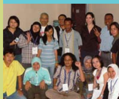
ANNUAL HUMAN RIGHTS TRAINING PROGRAM, JAKARTA, INDONESIA