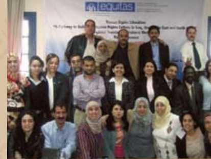
TRAINING OF TRAINERS, RABAT, MOROCCO