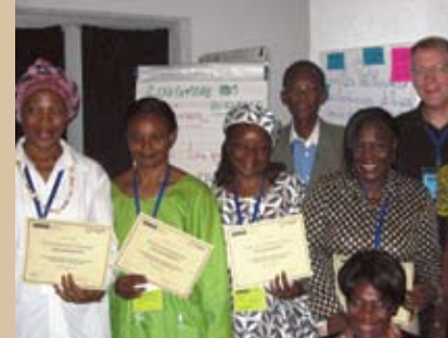
TRAINING OF TRAINERS, OUAGADOUGOU, BURKINA FASO