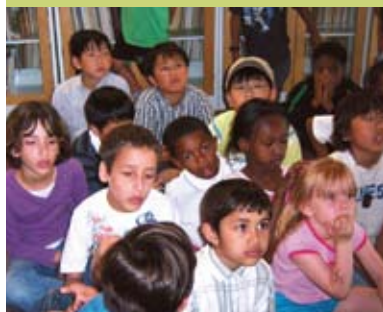
CHILDREN REFLECT AFTER A GAME IN MONCTON

THANK YOU VERY MUCH FOR SELECTING ME FOR THE IH RTP. DURING THIS WONDERFUL PROGRAM, I LEARNED LOTS OF THINGS ABOUT HUMAN RIGHTS THAT I DID NOT KNOW. NOT ONLY THAT, I LEARNED LOTS OF THINGS FROM OTHER INTERNATIONAL PARTICIPANTS. I AM SHARING WHAT I GAINED WITH MY FRIENDS, STAFF, AND THE PEOPLE.