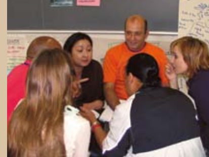
INTERNATIONAL HUMAN RIGHTS TRAINING PROGRAM, MONTREAL, CANADA